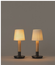
Básica Mínima Batería