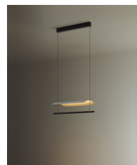
Lámina 45 / 85